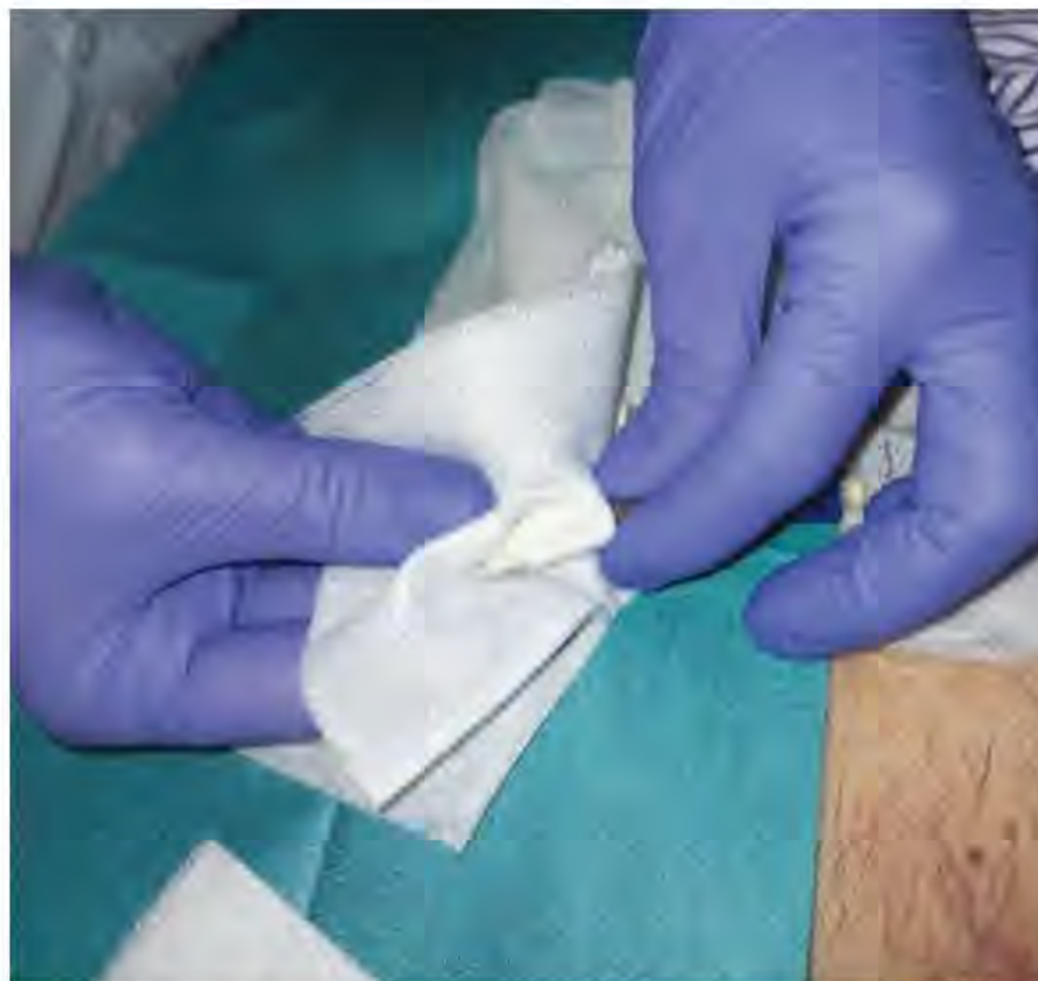
Figure 2. Disinfection of the connector with chlorhexidine: a simple step that saves lives

Therefore, catheters should be reserved solely and exclusively for hemodialysis and handled by qualified staff. Also, each Hemodialysis Unit must have a protocol thoroughly describing the use of an aseptic technique for catheter placement and subsequent management ( see Figure 2 ).