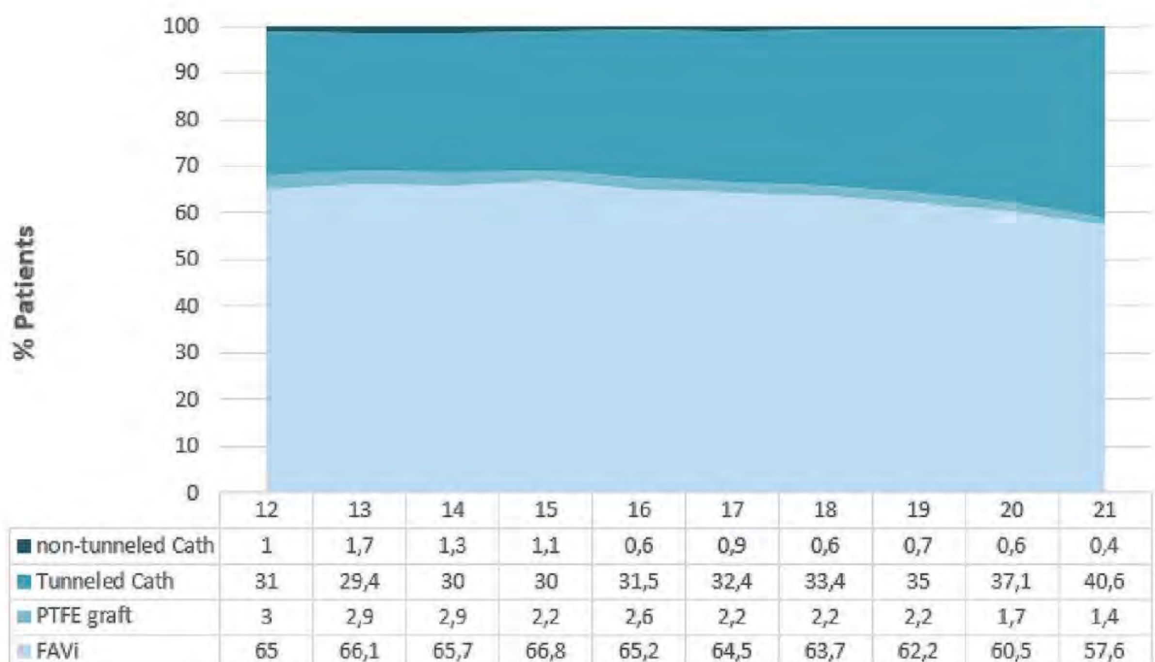
Figure 1. Evolution of prevalent vascular access use in Andalusia 2012-2021

As previously indicated, hemodialysis catheter-related complications include infectious complications, like the development of associated bacteremias, most of which are caused by gram-positive flora colonizing the skin around the catheter insertion site. 5