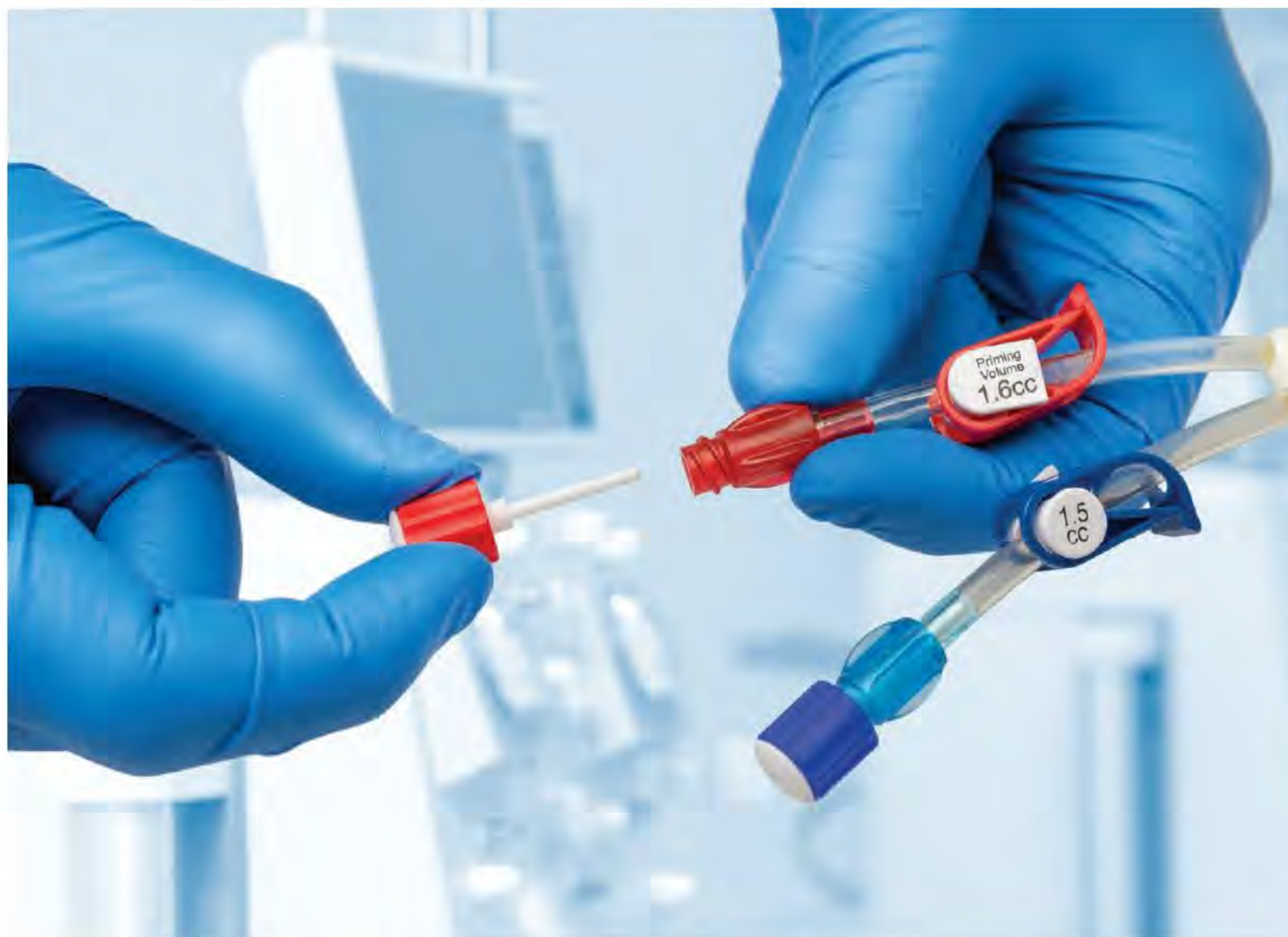
ClearGuard™ HD Antimicrobial Barrier Caps are a simple, yet effective, tool to reduce hemodialysis catheter infections

catheter hub, this rod extends into the hub, providing ongoing disinfection while the cap remains in place. 4 This mechanism not only offers a physical barrier to contamination but also ensures sustained antimicrobial activity, which can deter bacterial colonisation that could otherwise lead to a bloodstream infection.