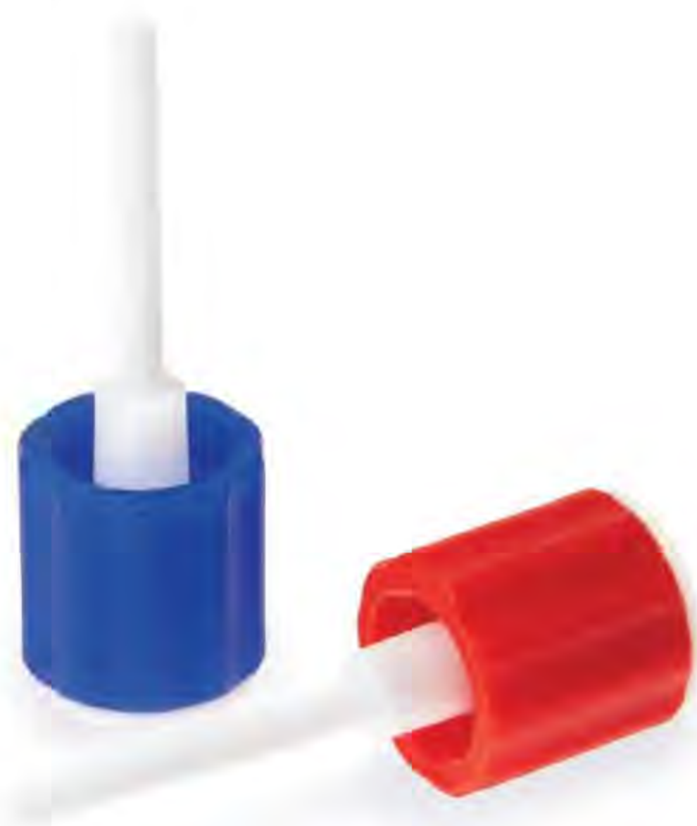
ClearGuard™ HD Antimicrobial Barrier Caps, ICU Medical

The literature describes a frequency of catheter-related bacteremia ranging from 0.4 to 6 episodes per 1000 catheter-days, which is consistent with an incidence of 0.15-2 episodes per catheter-years, 6,7 these episodes being 2-3 times more common among patients using non-tunneled catheters, compared to those using tunneled catheters. 8