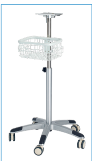
V3305 Roll Stand